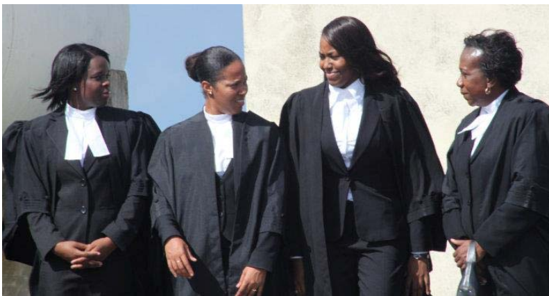
(Left) Local attorneys at law of the Montserrat Bar Association.