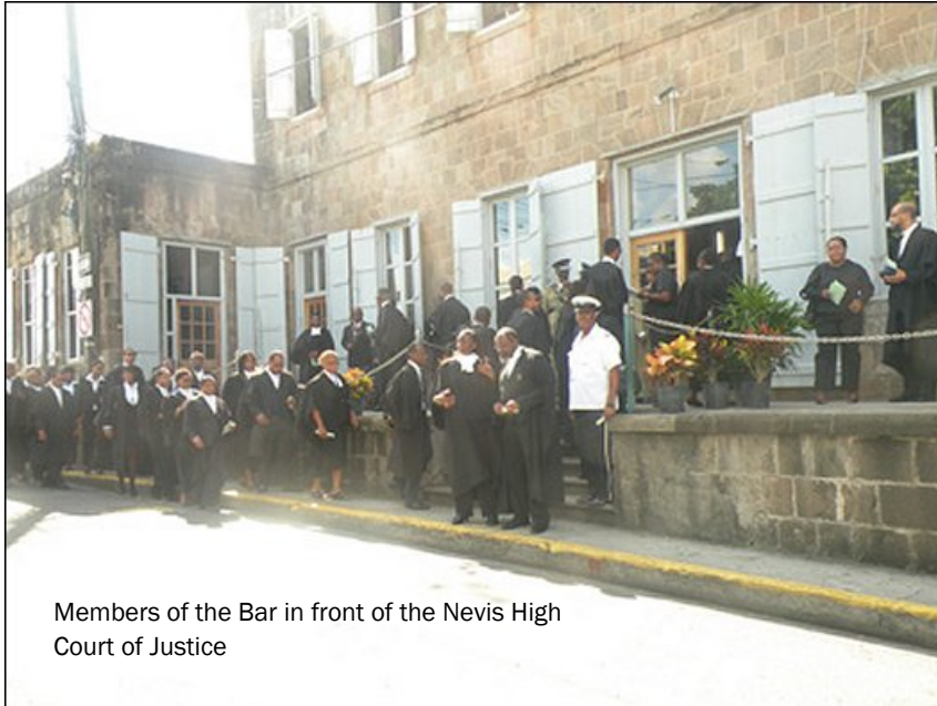
Members of the Bar in front of the Nevis High Court of Justice