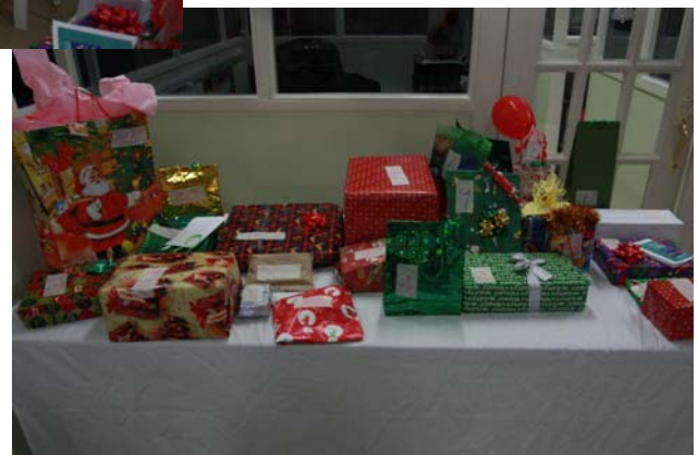
The Court's foyer was transformed to reflect the celebratory nature of the Event.