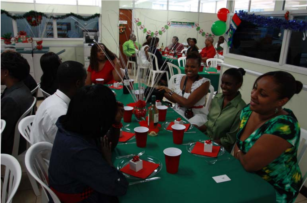
Members of staff await their turn to be served.