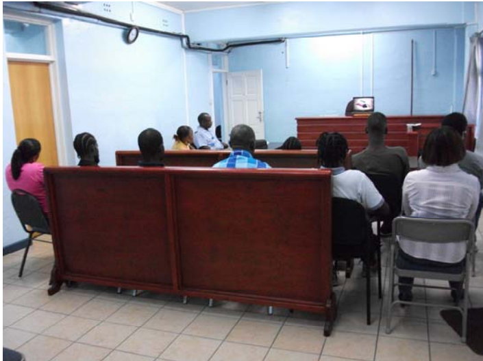
Orientation Session in Progress, (Castries - North)