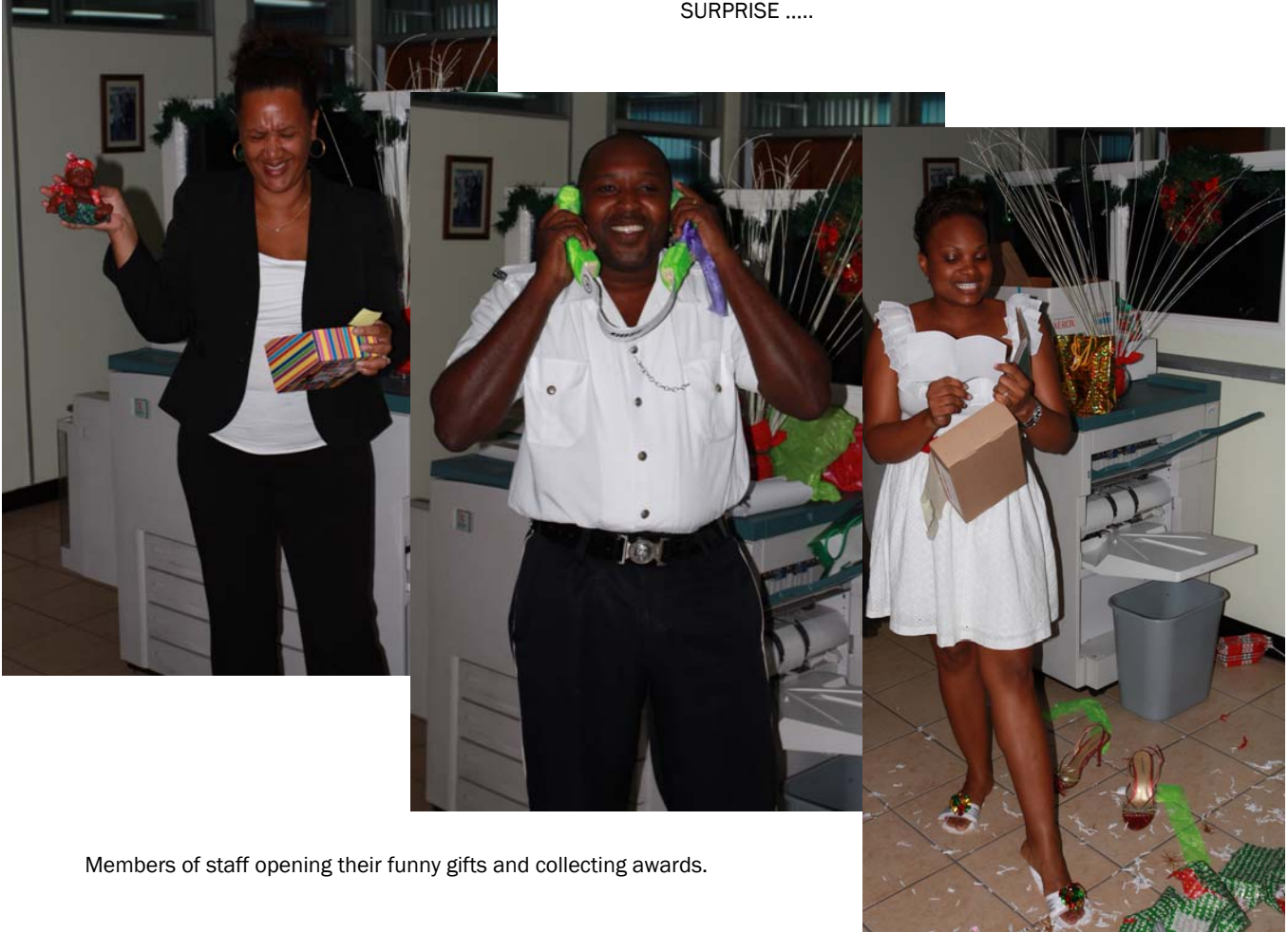
Members of staff opening their funny gifts and collecting awards.