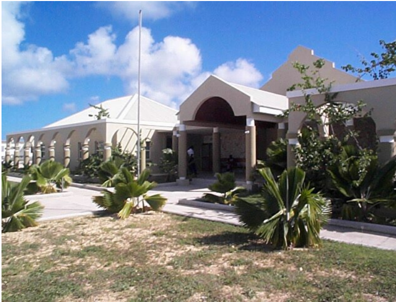
The New Anguilla High Court and Magistrate's Buildings