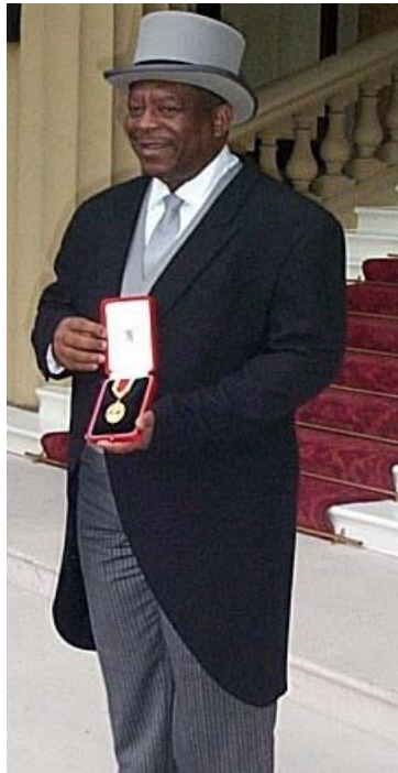
Sir Dennis Byron, displaying his Insignia of Knighthood on the steps of Buckingham Palace

On 27 th October 2000 HRH Prince Charles, invested me with the Knight Bachelor's medal at Buckingham Palace. The ceremony was regal and impressive. On that day a total of 4 Knighthoods and 121 other honours were conferred. The experience was given a special