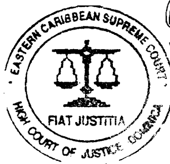
Justice Brian Cottle